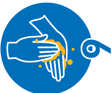
The tips of fingers