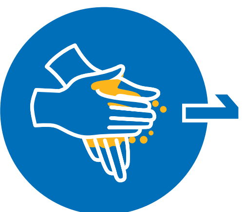
Palm to palm