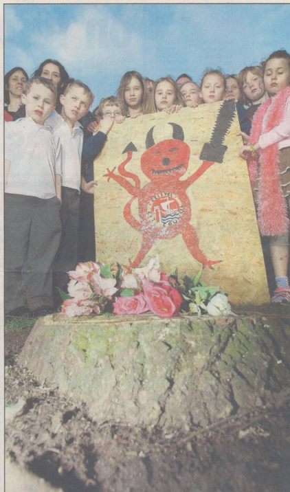
A KICK IN THE TEETH: Residents gather around the stump of the tree in Redland Green

He said: "This was a self-seeded tree which started growing as a sapling 20 years